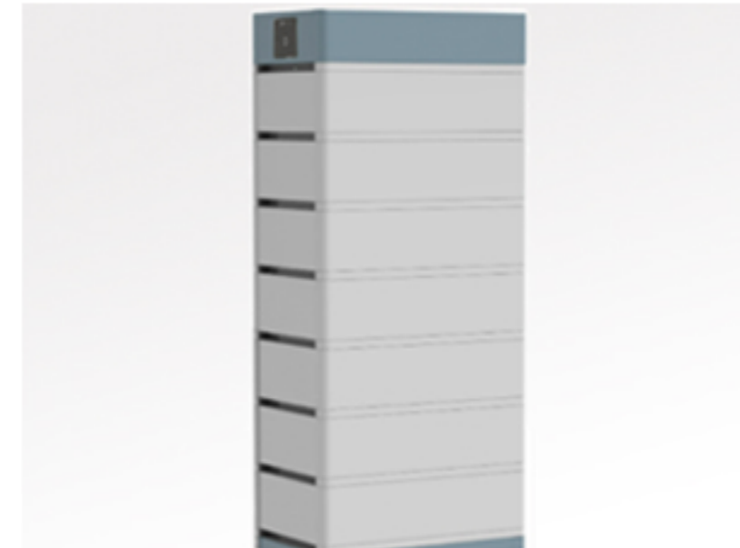
Household Energy Storages